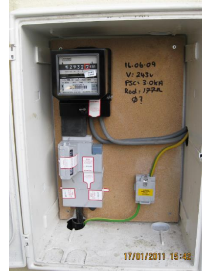
With polymeric/plastic incoming cable