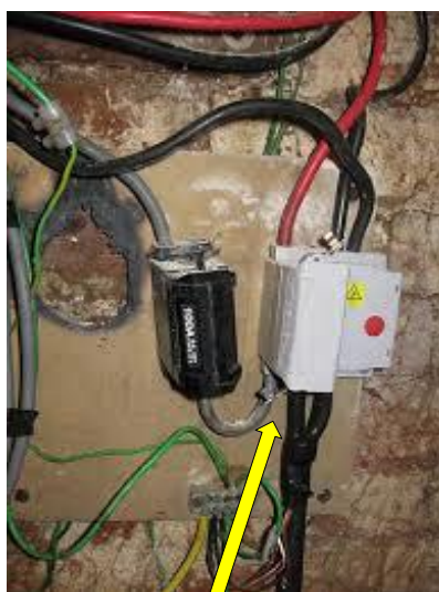
There are two customer supplies looped from a single phase incoming service.